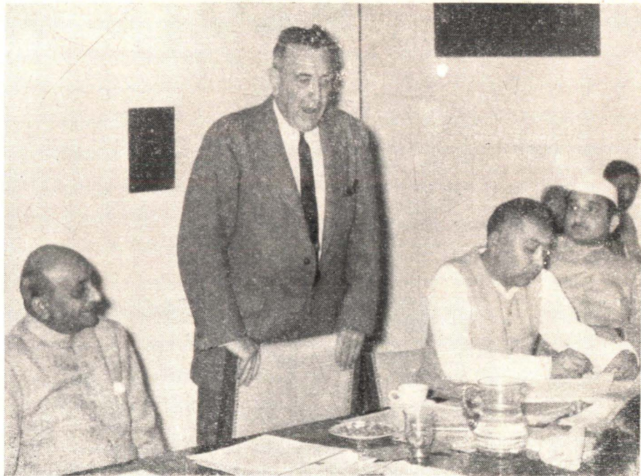
Shri Chester Bowles addressing the members of the Forum

This Committee will look after the day to day working of the Forum.