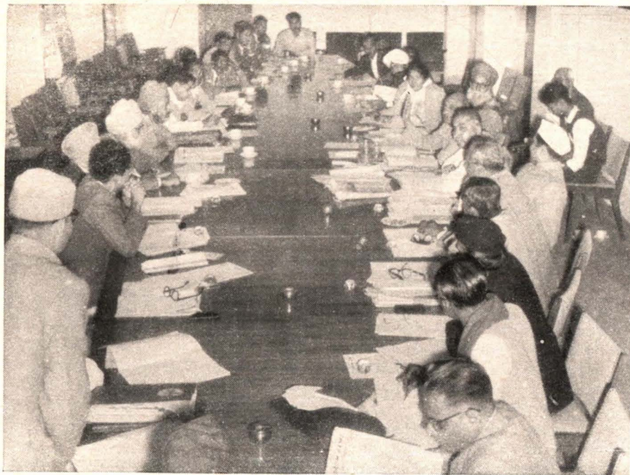
The Governing Body of the Forum meeting at New Delhi